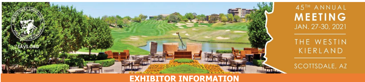
Exhibit Hall Dates and Hours*